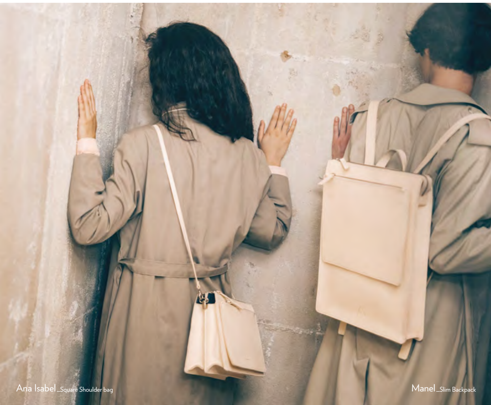
Ana Isabel_Square Shoulder bag