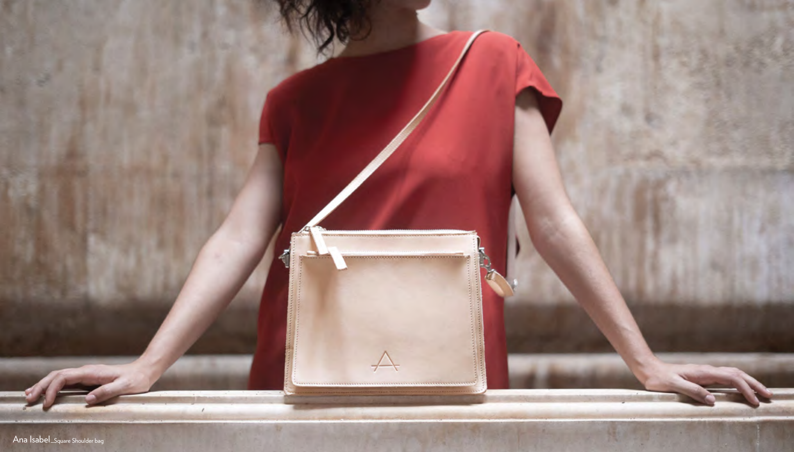
Ana Isabel_Square Shoulder bag